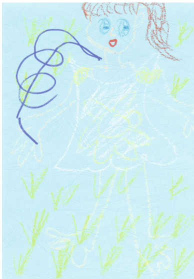
Image 1 from the patient A, with the title of “The Dancer on the Earth”