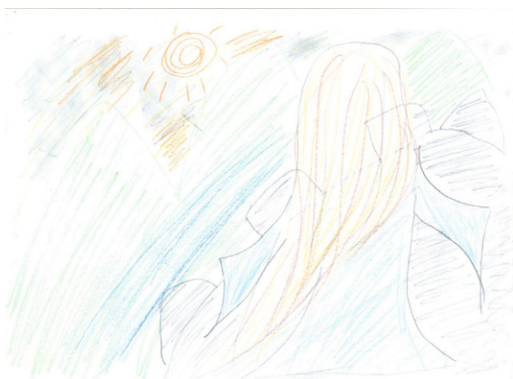
Image 2 from the patient A with the title of “The Long-Haired Princess Imprisoned in the Castle”